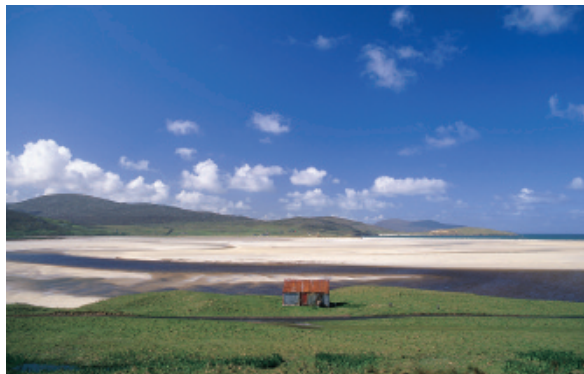
Left: A wide view looking south from Luskentyre on a glorious late spring day towards distant Toe Head.