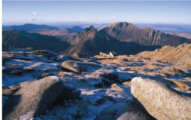
Towards the Hebrides. A wintry view from the 874m granite summit of Goat Fell, Arran's highest mountain.