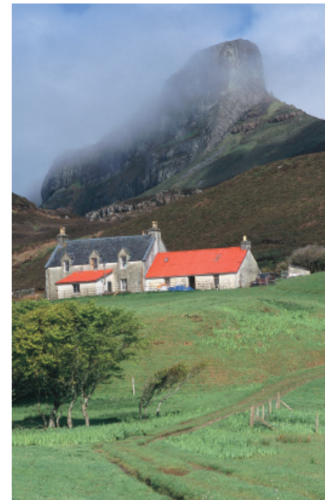
An Sgurr from Galmisdale.