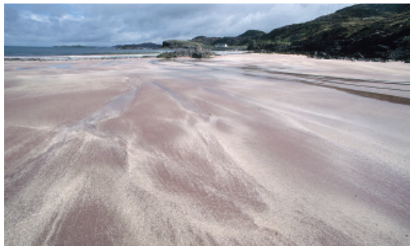
The broad pinkish sands of Clashnessie Bay on the Rhu Stoer peninsula.