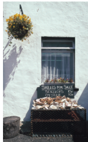
Shells for sale, Stein.